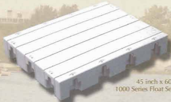
45 inch x 60 inch 1000 Series Float Section

This extra confidence allows the rowers to concentrate on the rowing event, rather than worry about their footing.